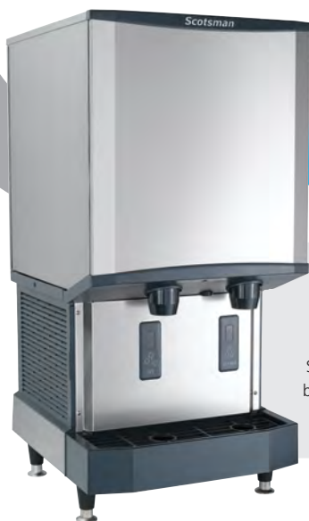
HID540A-1 with optional KLP24A legs

Sealed, maintenance-free bearings ensure maximum reliability and contribute to a long machine life